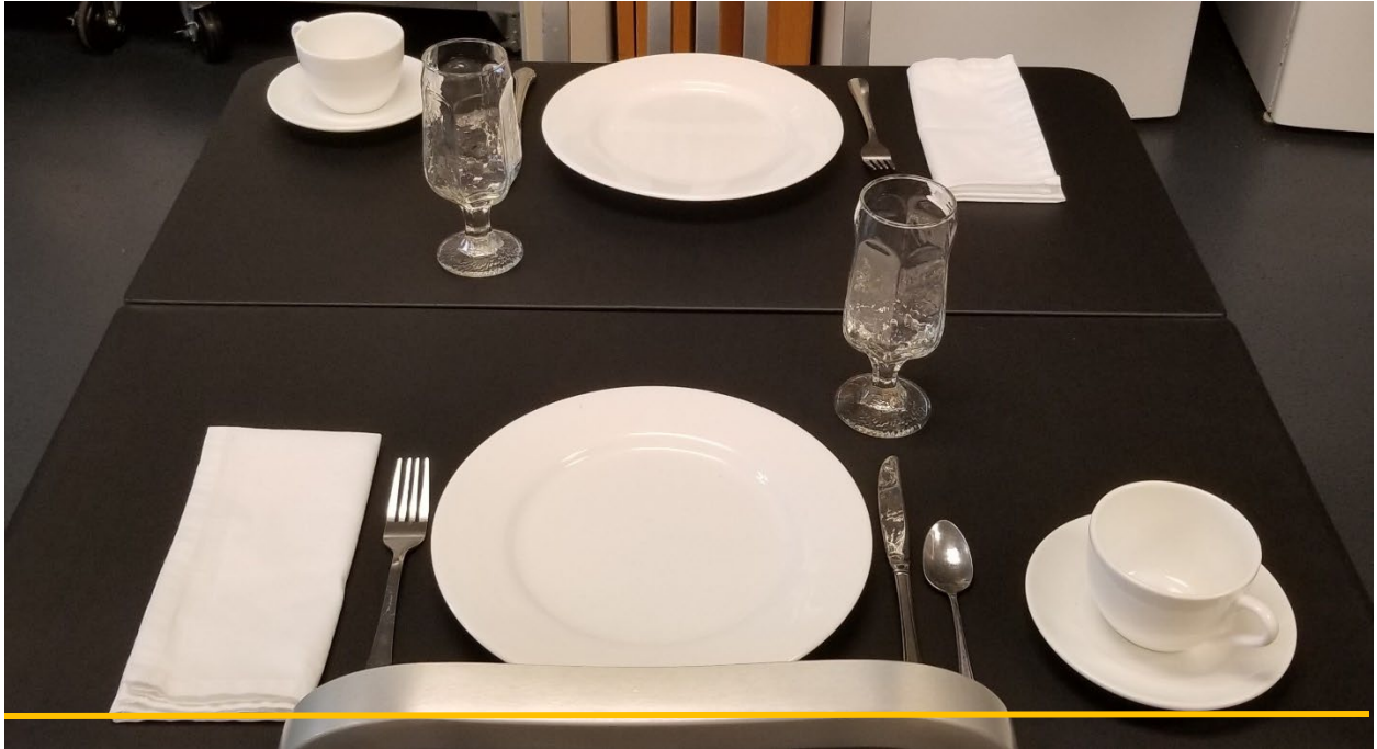
Table Setting Information Sheet Cont.

You will be provided with the following: